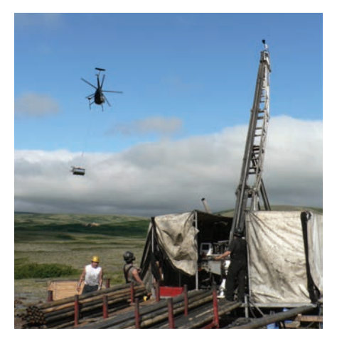
Exploration drilling at the Pebble prospect, approximately 120 miles north of Bristol Bay.

Having never used its authority preemptively, the EPA decided instead to conduct a watershed assessment to help "inform its decision" on the issue. The EPA study began in February 2011, and the agency completed the assessment on an area the size of West Virginia in less than