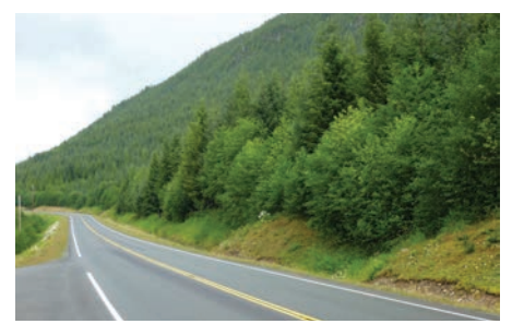
Originally an old logging road, a state highway now cuts through a ridge of second-growth timber in the Tongass National Forest.

RDC pointed out in its comments that the Roadless Rule should not apply in Alaska because it violates the "no-more" clause of the Alaska National Interest Lands Conservation Act (ANILCA) and conflicts with other laws by preventing multipleuse management of vast acreage. Together