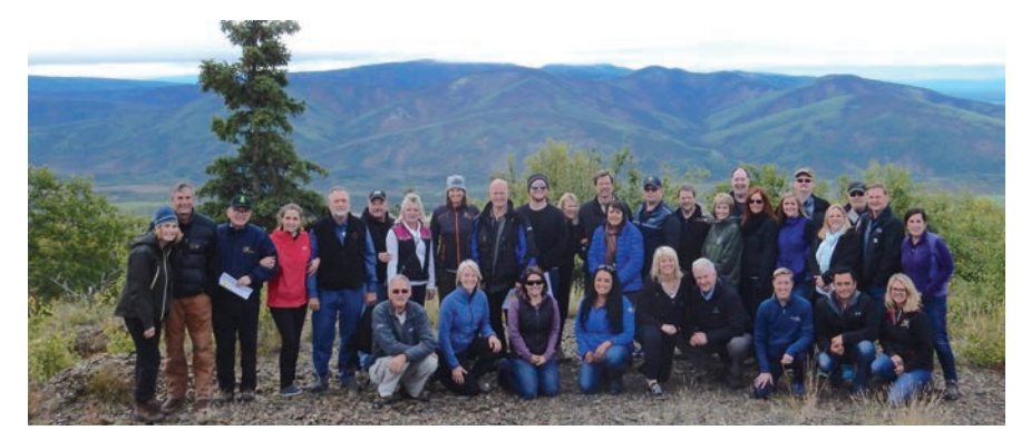
The first stop on RDC's journey to Prudhoe Bay was a tour of the Livengood Gold Project 70 miles north of Fairbanks. Tower Hill Mines has spent $220 million to date advancing the project, which has a resource base larger than Fort Knox and Pogo mines combined.

Thank you sponsors! Alaska Airlines Aleut Corporation BP Exploration (Alaska), Inc. Brooks Range Petroleum Caelus Energy Alaska Colville, Inc. ConocoPhillips Alaska, Inc. ExxonMobil Holland America Line Lynden Tower Hill Mines, Inc. UIC Usibelli Coal Mine, Inc.