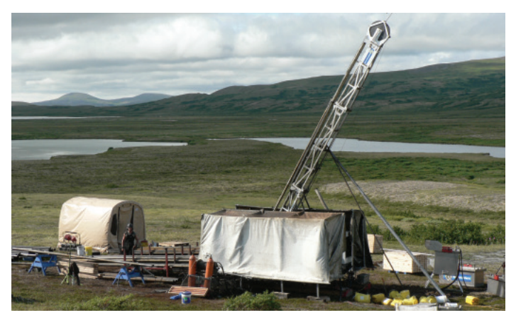
Early exploration activity at the Pebble prospect in Southwest Alaska.

The beluga whale listing was opposed by RDC, the State of Alaska, and local communities in part out of concern it would be used by environmental groups to litigate and stop projects. Despite claiming an ESA listing does not stop projects, groups have used the listing to challenge seismic testing, the Knik Arm bridge, and other projects.