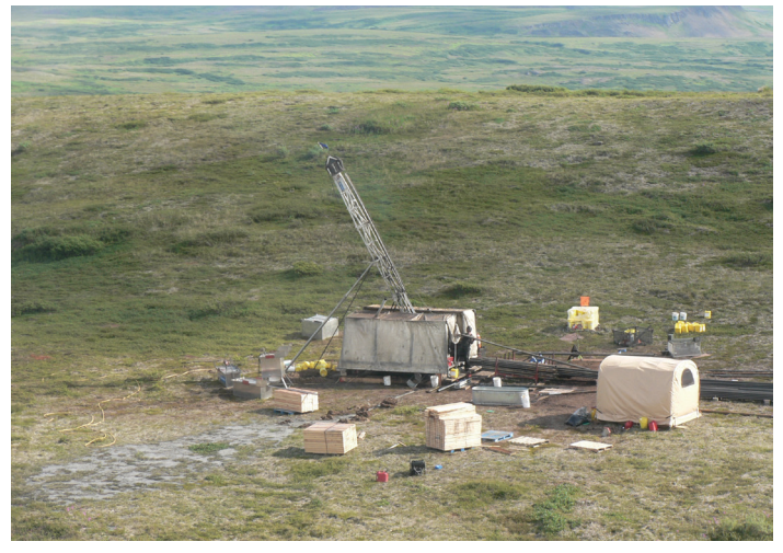
Above is a remote drilling site on the Pebble prospect located on state land open to mineral leasing, approximately 20 miles west of Lake lliamna in Southwest Alaska.

As Alaska continues to look for ways to attract new jobs and economic activity, we believe the Pebble Project has a valuable role to play. This project represents the potential for billions of dollars of investment, thousands of long-term, high-wage jobs and