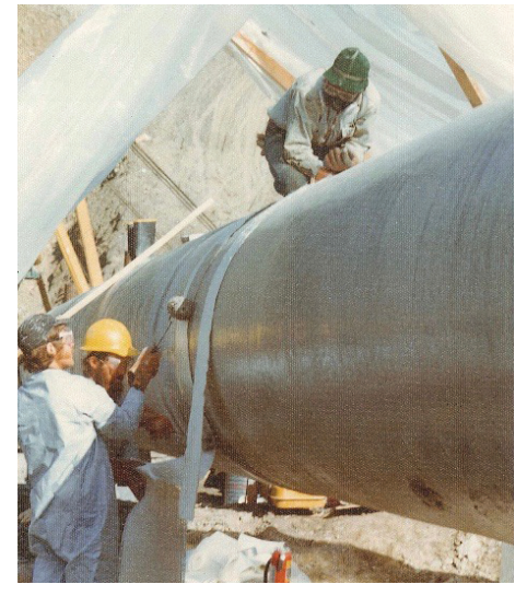
Crew insulates a joint on the pipeline north of the Yukon River in the summer of 1976.

At the time construction began in 1974, TAPS was the largest private construction