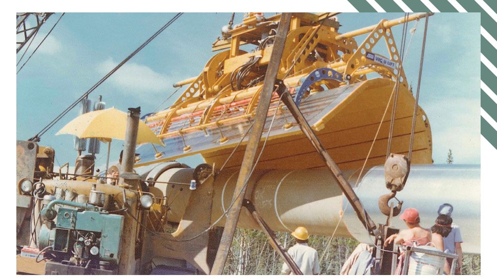
TAPS construction near the southern foothills of the Brooks Range in 1976. Oil from the North Slope and the pipeline that carried it brought great wealth to Alaska.

TAPS: "We didn't know it couldn't be done."