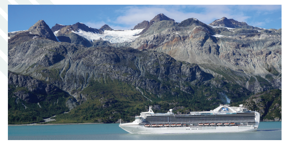
In 2016, 55 percent of visitors to Alaska arrived by cruise ship. More and larger ships are coming to Alaska as demand for Alaska cruises remains high.