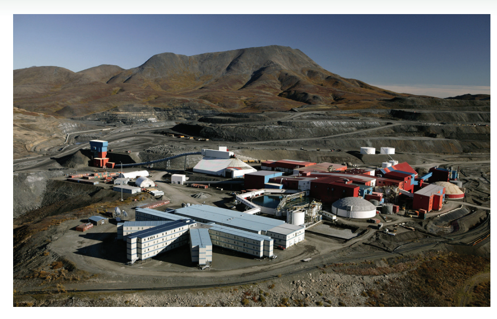
The Red Dog Mine in Northwest Alaska, located on NANA Regional Corporation land and operated by Teck Alaska, is one of the largest zinc mines in the world. Only two of Alaska's six large operating mines are on federal lands.

In separate comments to the BLM, both AMA and RDC noted land withdrawals of this size are in direct conflict with the