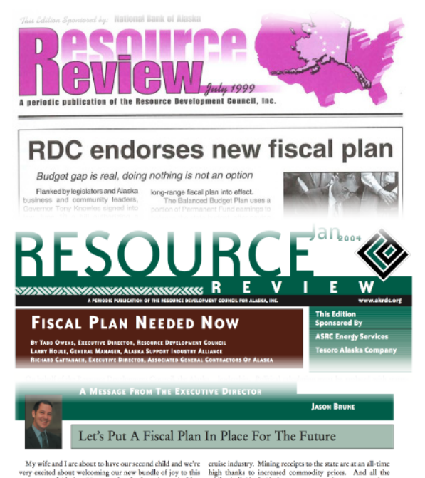
All previous issues of the Resource Review are available at akrdc.org/resource-review-newsletters.

The time is now to act, doing nothing is not an option.