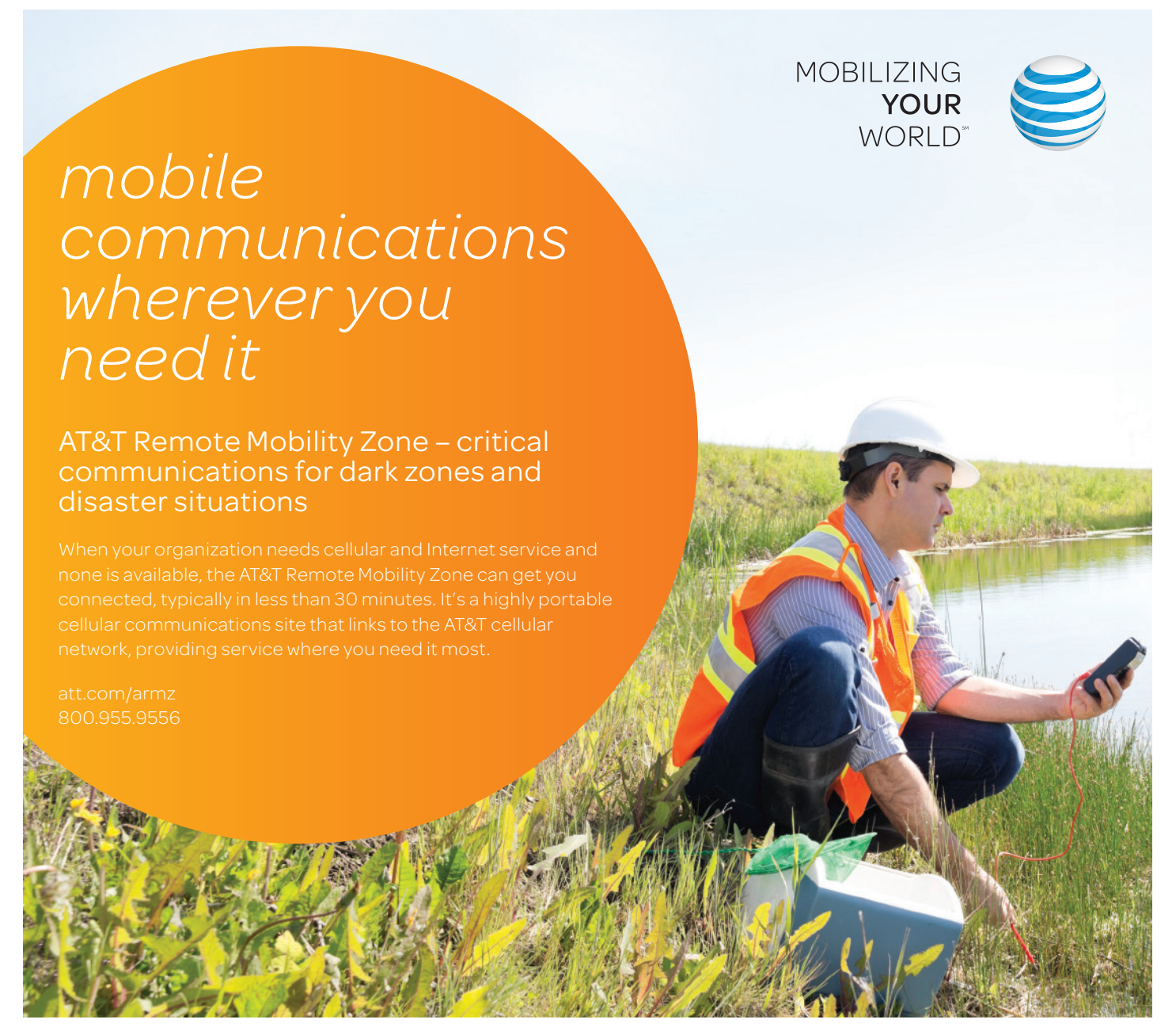
©2015 AT&T Intellectual Property. All rights reserved. AT&T, the AT&T logo and all other AT&T marks contained herein are trademarks of AT&T Intellectual Property and/or AT&T affiliated companies. All other marks contained herein are the property of their respective owners. This document is not an offer, commitment, representation or warranty by AT&T and is subject to change.