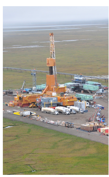
The Greater Mooses Tooth field in NPR-A came on line in 2018

In general, RDC said BLM should eliminate measures that are too restrictive, make exploration and development extremely challenging or infeasible, eliminate measures that are duplicative of other agency responsibilities, and eliminate measures that are not based on science or add unnecessary provisions that do not provide environmental or subsistence benefits.