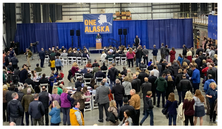
Hundreds gather at a OneALASKA rally in February at Delta Constructors in Anchorage to express opposition to the oil tax ballot measure.

As business people in the resource industries, you understand what it means to invest for the long term. Why would anyone invest in Alaska with such an outrageous tax policy?