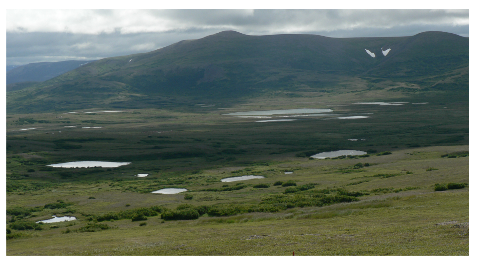
Above is the site of the Pebble project approximately 200 river miles north of Bristol Bay.

The final EIS is expected to be released this summer.