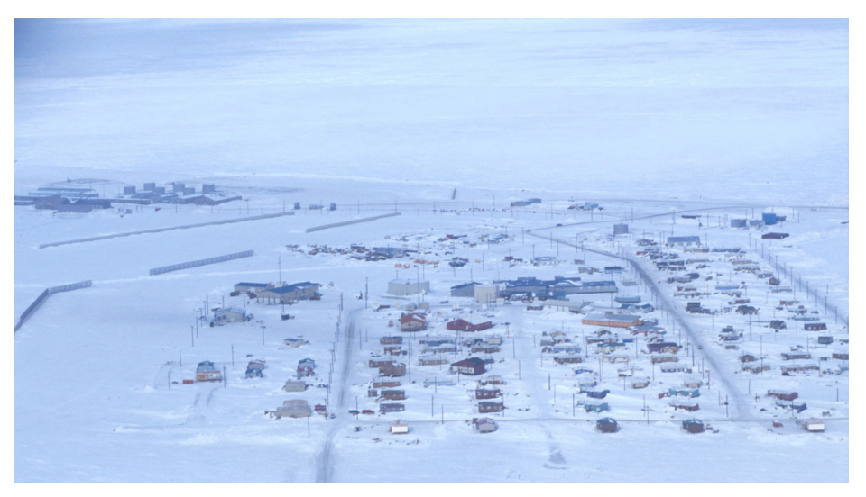
The village of Kaktovik is located on the coastal plain of the Arctic National Wildlife Refuge. Most residents in the village support oil and gas development in the 1002 Area.

The U.S. Interior Department chose option B as its preferred alternative in the final environmental impact statement for the Coastal Plain Oil and Gas Leasing Program within the Arctic National Wildlife Refuge (ANWR). Option B would open only the 1.5 million-acre "1002 area" to oil and gas leasing, while 550,000 acres of the eastern coastal plain stretching to the Canadian border would remain closed. That area is designated as federal Wilderness, which prohibits all types of development.