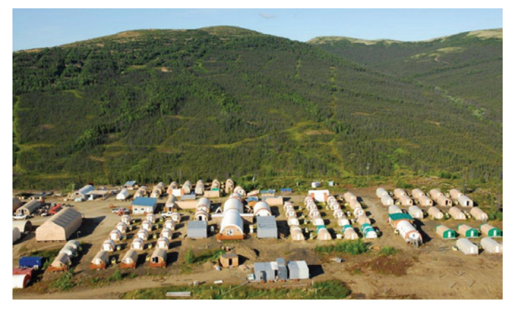
The proposed Donlin Gold mine has the potential to improve the quality of life and provide jobs for residents in the Kuskokwim region.

Calista has ownership of mineral rights in the proposed mining area, and Donlin Gold has ensured hiring preferences for qualified Calista shareholders, descendants and their spouses, and bidders' contracting preference for Calista subsidiaries. An estimated 3,000 jobs will be created during the construction phase of the project, which is anticipated to last three to four years. As it moves forward into the 27-year operation phase, 600 to 1,200 high-paying, full-time