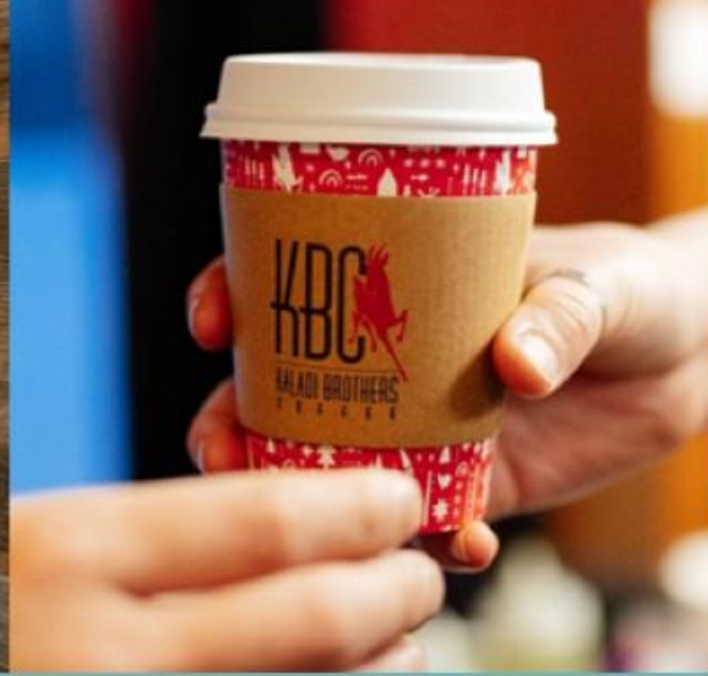
Kaladi Brothers coffee in Anchorage Lounge