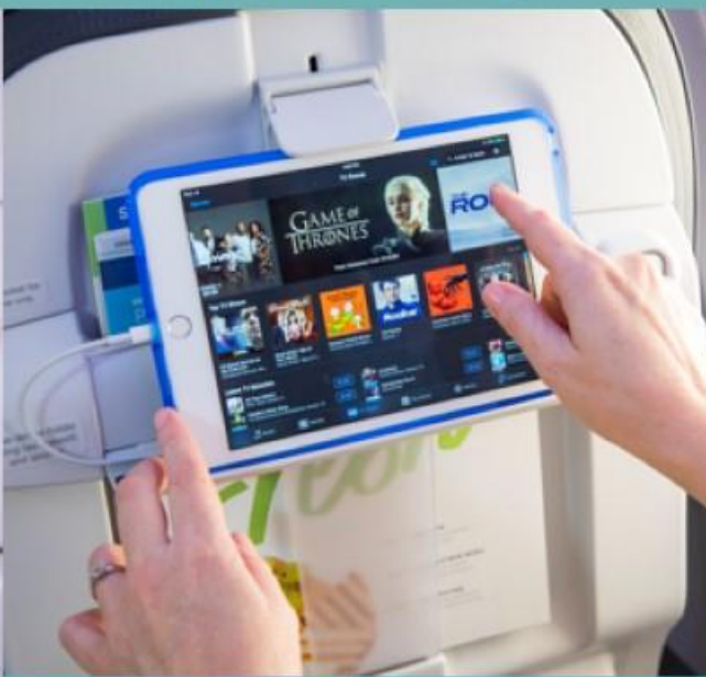
Free movies & texting