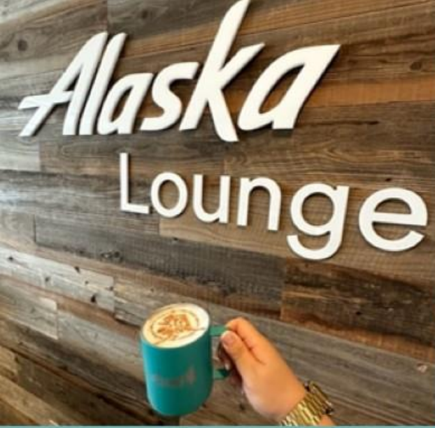
Remodeling ANC Lounge in 2024/early 2025