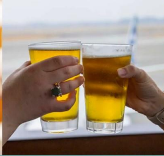
Alaskan Brewing Co. served in our Lounges