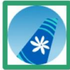
Air Tahiti Nui