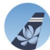
Southern Airways Express